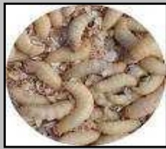
Wax Moth Larva (Galleria Mellonella) Good shelf life if kept cool, remove head

New Patients – Before feeding are given rehydration fluid