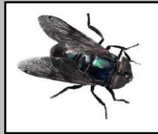
Bluebottle (Calliphora Vicini) Freeze See instructions for easy breeding.