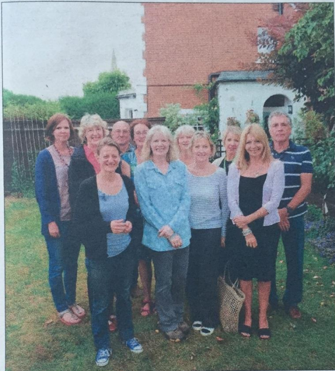
SWIFT ACTION: Members of the new group. Ref:123152-3

MAIDENHEAD: Birdwatchers have set up a new group to help East Berkshire's swift population.